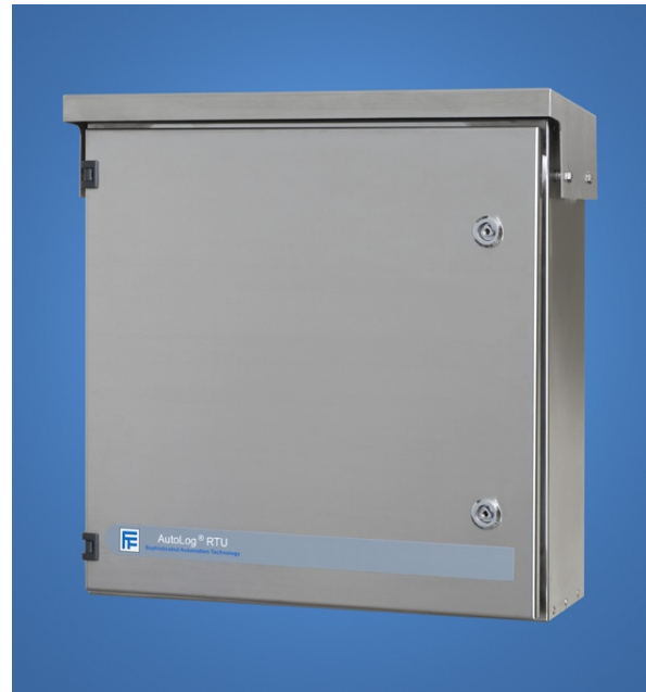
AutoLog® 20AN RTU in IP54 enclosure